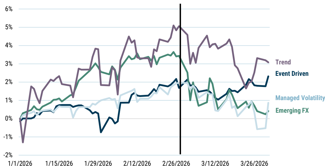
Exhibit 3: ARP Q1 Performance

Exhibit 3 shows year-to-date performance for the ARP strategies in which ALTA invests. The chart highlights the sharp reversal across strategies coinciding with the start of the war, most notably in Trend and EM FX. Each shock is different, and it is worth noting that the equity sell-off in March was more orderly than most. The drawdown for Event-Driven was fairly shallow. Trend had largely rotated positioning by the third week of March, therefore experiencing a sharp recovery.